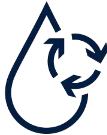
Alternative fuels and electrification