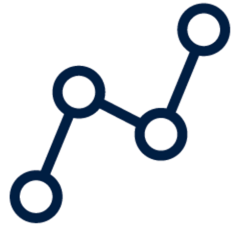
Smart and safe transport